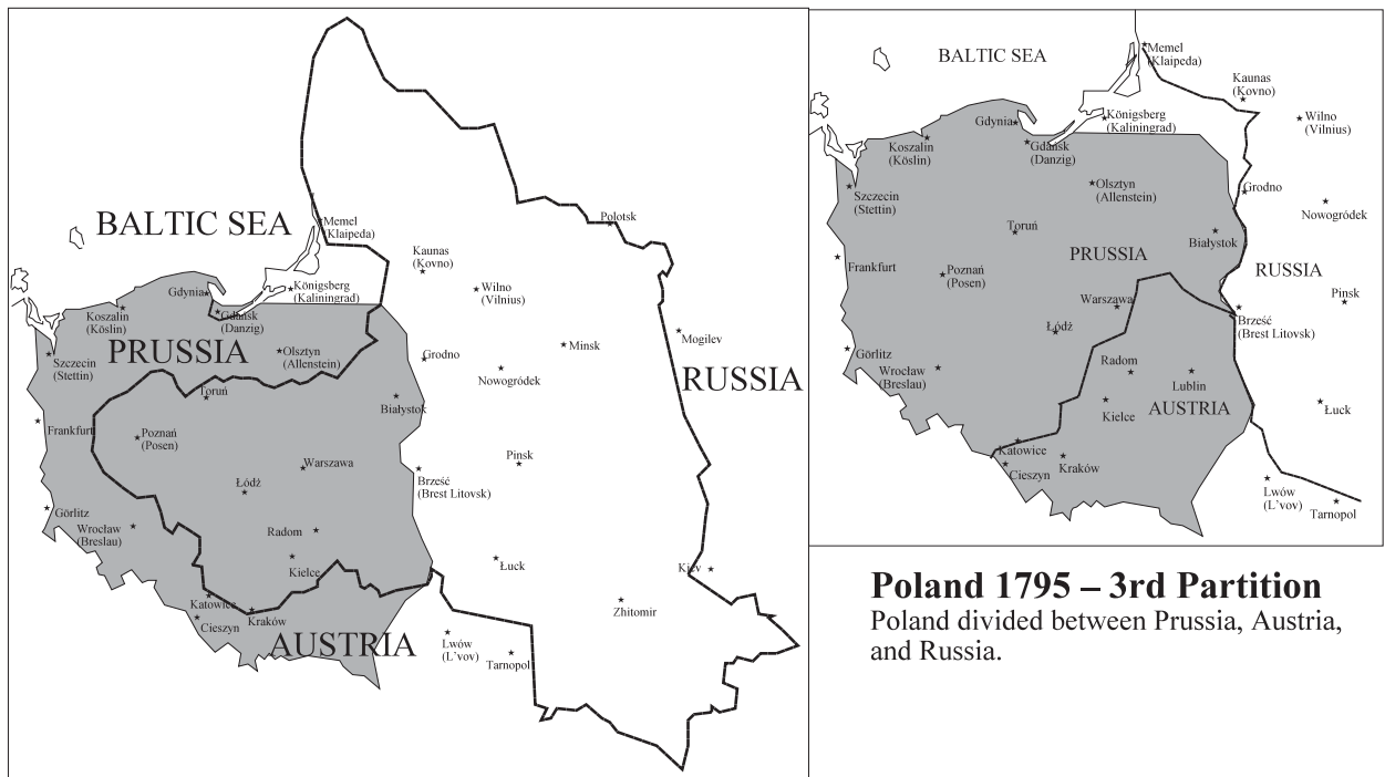
Poland 1772 – 1st Partition